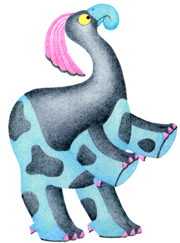
the blue-nosed teaser